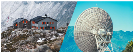
Isolated sites (Scientific bases, living quarters, refuges, islands, relay antennas)