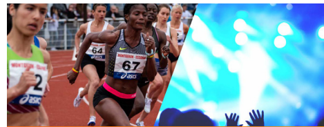
Events (Concerts and temporary or sporting events)