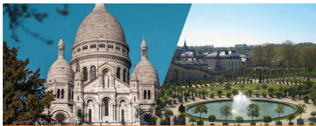
Protected and regulated areas (Zero-emission zones)