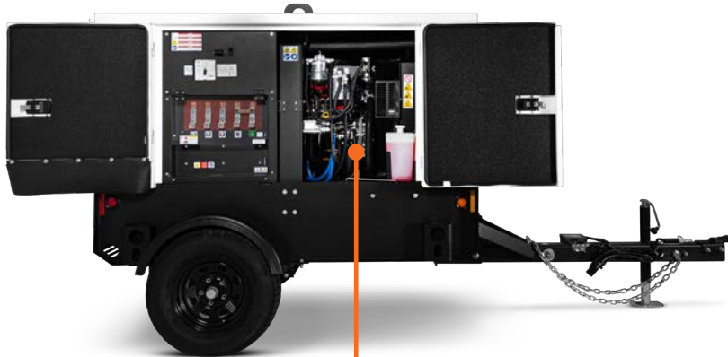
FINAL TIER 4 ISUZU ENGINE

*Results may vary based on factors including age and maintenance of equipment, environmental conditions and fuel density. Consult the Owner's Manual for fuel and maintenance recommendations.